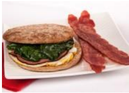
Budget-Friendly Egg, Ham and Spinach Sandwich