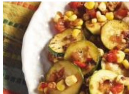
Zucchini With Corn and Peppers