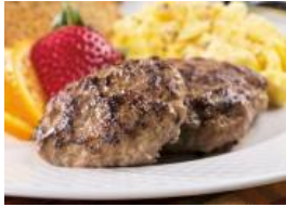
Guilt-Free Breakfast Sausage Patties