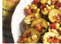
Zucchini With Corn and Peppers