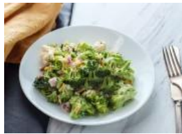
Southern Broccoli Salad