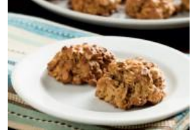
Peanut Butter Banana Oat Bites