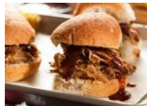
Slow Cooker BBQ Chicken Sliders