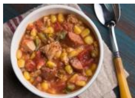
Cajun-Style Corn Soup