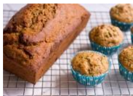
High-Fiber Zucchini Muffins