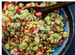
Grape Tomato Succotash