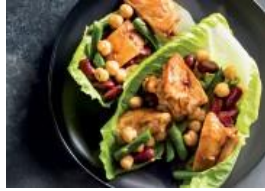
Smoky Chicken and Three Bean Salad