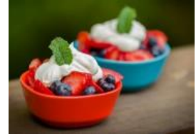
Berries and Cream