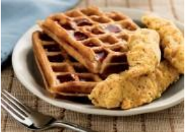
Whole Grain Chicken and Waffles