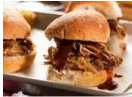
Slow Cooker BBQ Chicken Sliders