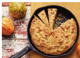
Skillet Caraway Cornbread