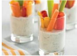
Veggie Dip Cups