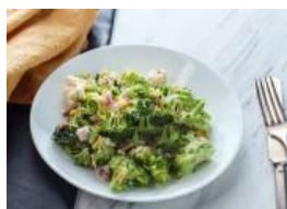
Southern Broccoli Salad