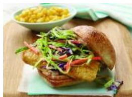
Cajun Fish Sandwiches With Crunchy Slaw