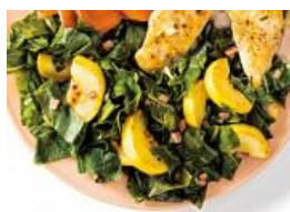
Collard Greens with Yellow Squash