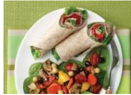
Roast Beef Rollups