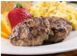
Guilt-Free Breakfast Sausage Patties