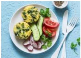
Easy Egg Muffins