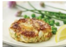
Traditional Lump Crab Cakes