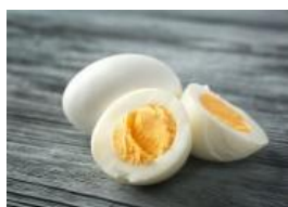
Hard Boiled Egg