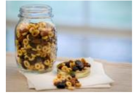
Power Snack Mix