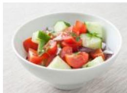
Simple Summer Cucumber and Tomato Salad