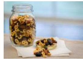
Power Snack Mix