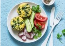
Easy Egg Muffins