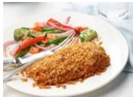
Air Fryer Buttermilk Fried Chicken