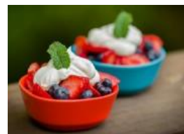
Berries and Cream