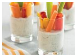
Veggie Dip Cups