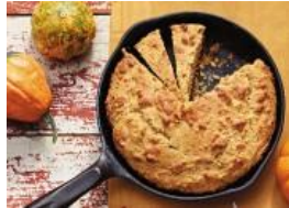
Skillet Caraway Cornbread