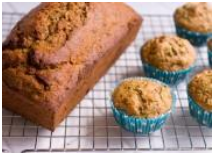
High-Fiber Zucchini Muffins