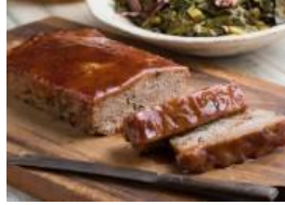
Slow-Cooked Meat Loaf