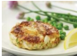
Traditional Lump Crab Cakes