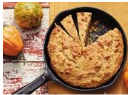
Skillet Caraway Cornbread