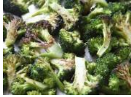
Crispy Baked Broccoli