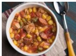
Cajun-Style Corn Soup