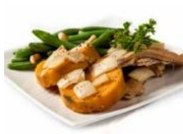
Budget-Friendly Slow-Cooker Chicken & Sweet Potatoes