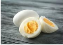
Hard Boiled Egg