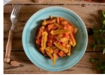
Tomato & Sweet Onion Stovetop Okra