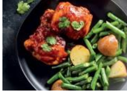
Smoky Pan Roasted Chicken with Potatoes and Beans