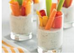
Veggie Dip Cups