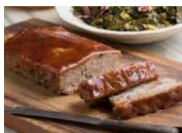
Slow-Cooked Meat Loaf