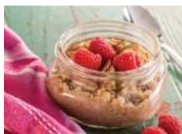
Cereal de avena y quinua