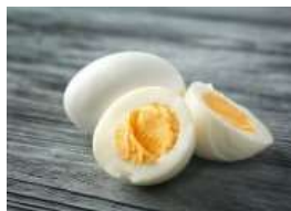
Hard Boiled Egg