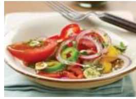
Sweet Pepper, Onion and Tomato Salad