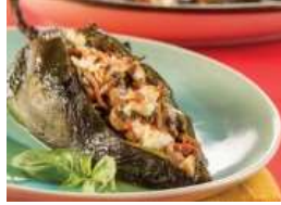
Poblanos Rellenos de Vegetales