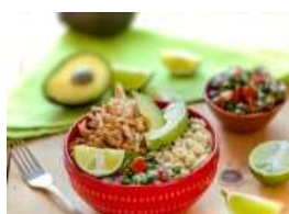
Brown Rice and Pinto Bean Bowl with Chicken and Pico de Gallo