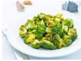
Cubano Roasted Broccoli Florets