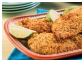
Latin Baked Fried Chicken