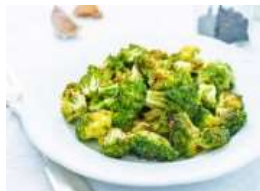
Cubano Roasted Broccoli Florets