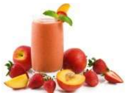
Fruit and Almond Smoothie