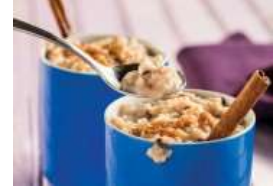
Arroz con Leche (Rice Custard)