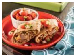
Ingrid Hoffmann's Carnitas Baked Chimichangas