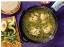
Huevos ahogados en salsa verde