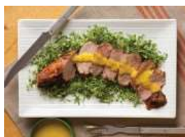
Mojo-Marinated Pork Tenderloin (Pernil)