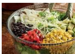
Chopped Mexican Salad with Lime