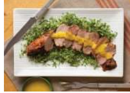
Mojo-Marinated Pork Tenderloin (Pernil)