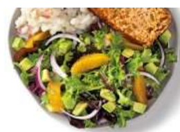
Green Salad with Orange, Avocado, and Onion