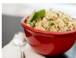
Cilantro Lime Quinoa