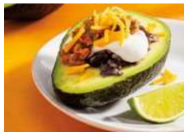
4-Layer Stuffed Avocado