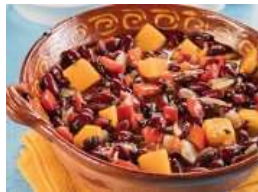
Kidney Bean Stew