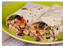
Chicken and Black Bean Burritos