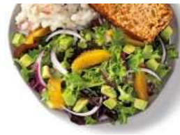
Green Salad with Orange, Avocado, and Onion