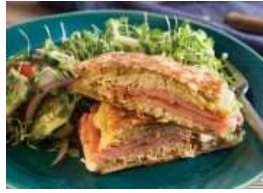
Ronaldo's Cuban Sandwich