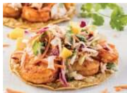
Smoky Shrimp Tostadas with Chipotle Mango Slaw