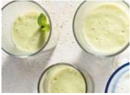
Moroccan Avocado Smoothie