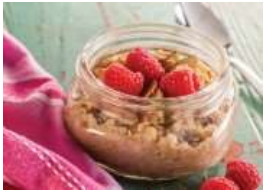
Cereal de avena y quinua