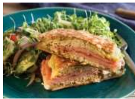
Ronaldo's Cuban Sandwich