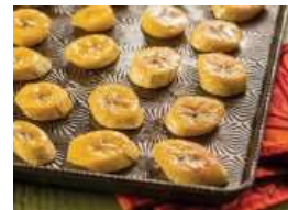
Maduros al Horno