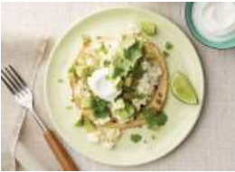
Blanco Huevos Rancheros