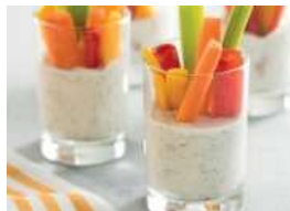
Veggie Dip Cups