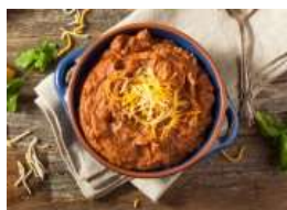
Frijoles Refritos Saludables