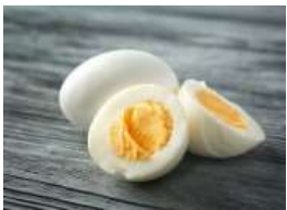
Hard Boiled Egg