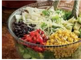
Chopped Mexican Salad with Lime