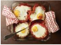
Sweet and Smoky Baked Eggs