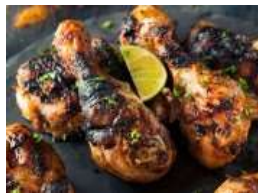
Budget-Friendly Cilantro Lime Roasted Chicken